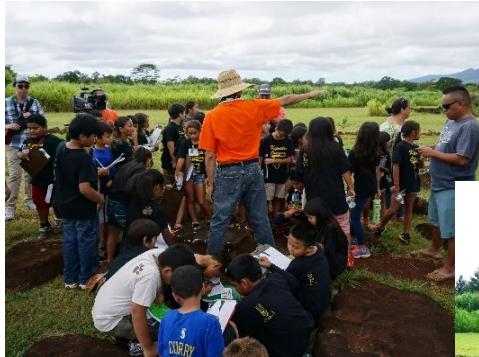
Mo'olelo- Traditional Comprehension and Science taught in the same place...

9.29.2k16...OC16 has a new series that will begin in November called "OC16 6Picks"... The first episode will be about the top six little know places. The crew was onsite with us during the Alu Like visit with Kipapa Elementary 4 th graders. They asked, "What is the message you want to share about this sacred site of Wahiawā?" Our answer: