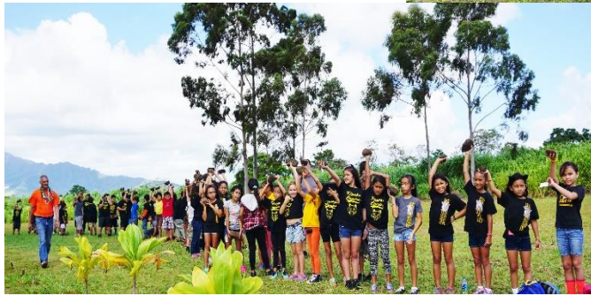
...and 77 more 'ili'ili to continue our Pā Pōhaku 'o Kamana'olana