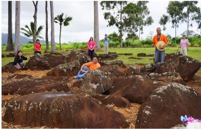
Mahalo to the onsite crew of OC16 and to the editors who share our mo'olelo in the new series OC16 6Picks.