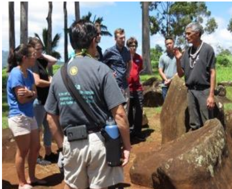
Mo'olelo – traditional comprehension