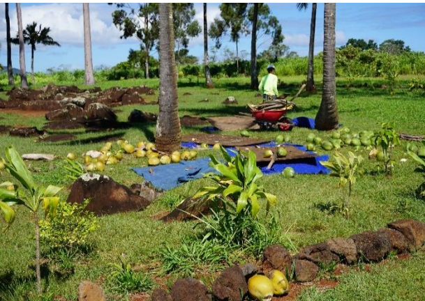
Pōhaku were covered with heavy, quilted halī'i and Plywood pieces to protect them from damage from falling debris or any of the necessary tools for work...